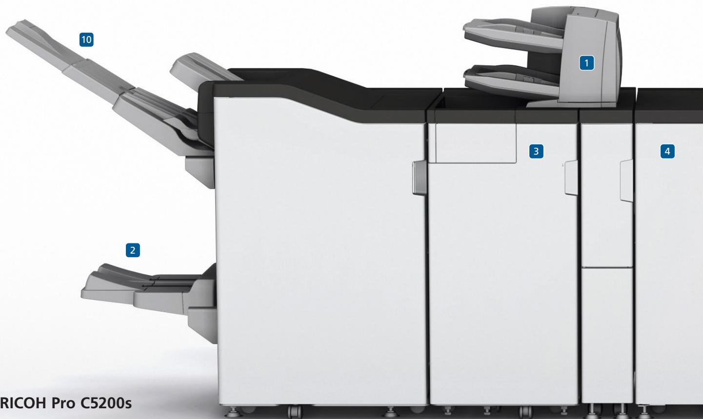
RICOH Pro C5200s